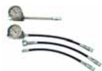
HP injection sets