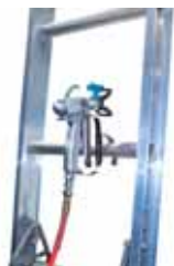
Airless spray gun with ladder holder