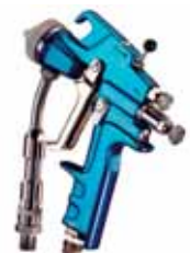
Aircombi spray gun