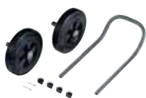
Wheel set A 4000